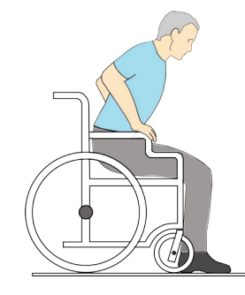
Client may have difficulty with transferring independently and needs to rely on a caregiver.