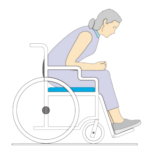
Client is unable to stand alone, which can lead to pressure injuries.